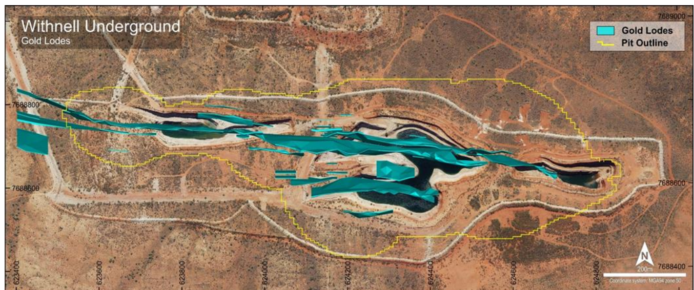
Figure 1 Withnell Plan view showing proposed open pit cutback and interpreted underground lodes.

The Withnell Underground model comprises 2.50Mt @ 3.9g/t for 317,062,100oz . Mineralisation remains open and further drilling is expected to improve resource categories with most of these resources in the Inferred category, reflecting the exploratory drilling for extensions both along strike and at depth. The underground resource has been reported using a 2g/t lower cut-off grade.